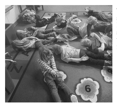
The ELC students learned proper stretching skills with different fun yoga poses.